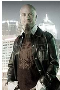
Worship by Charlie Hall