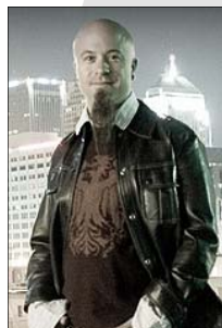
Worship by Charlie Hall